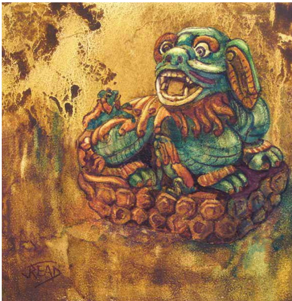
Final Painting © Julie Read, artist